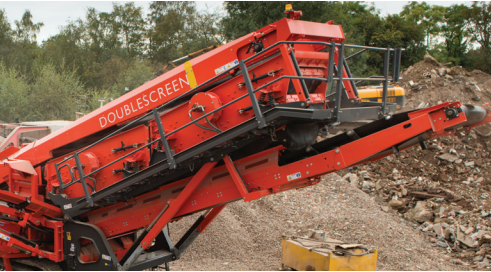
Hydraulically folding walkways for ease of maintenance