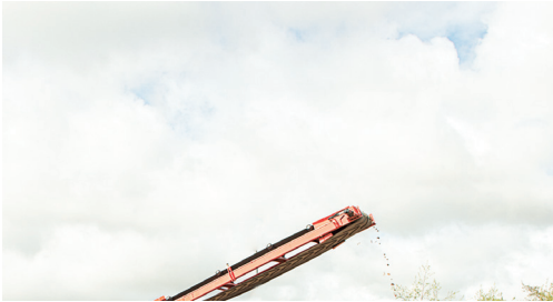
Patented triple deck Doublescreen technology