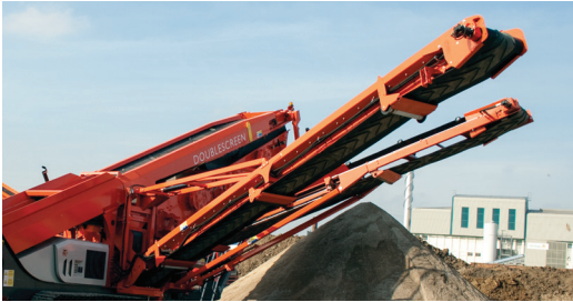
Hydraulic slew and raise / lower facility