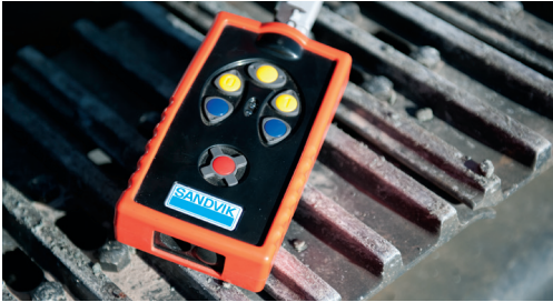
Remote control for ease of mobility