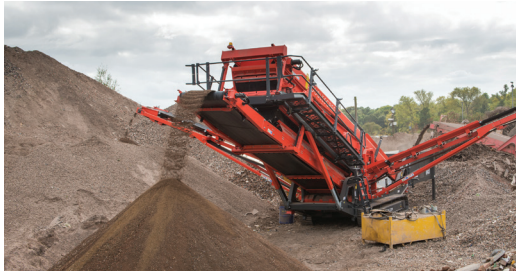
Massive stockpiling capabilities