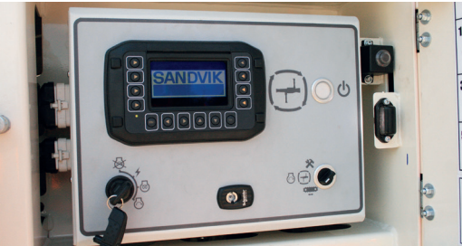
Simplified control panel for ease of operation